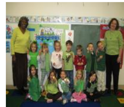
4 year Old Red Birds celebrate St. Patrick's Day 3-17-10