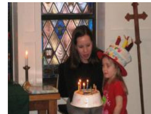
Celebration of a birthday in the chapel