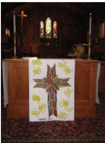
Cross made by the children at Kanuga