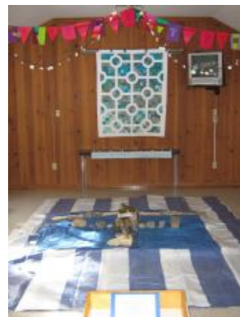
Meditation room at Kanuga made by the 5th & 6th grade class