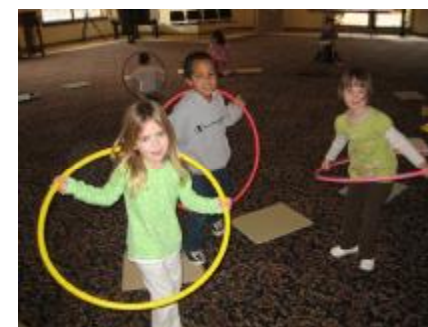
Red Birds at creative play