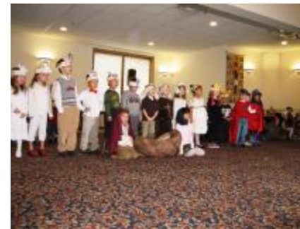
EDS Christmas Program

This is always a wonderful way to get to know others in the parish family, in a relaxed setting in the mountains near Hendersonville, NC.