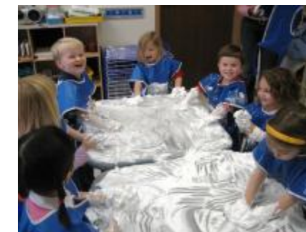
Yellow Birds with shaving cream