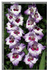
August Birth Flower: Gladiolus