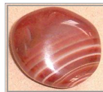
August Birthstone: Sardonyx