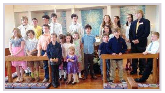
A Great Dismissal!