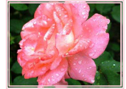
June Birth Flower: Rose