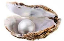
June Birthstone: Pearl