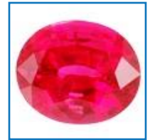
August Birthstone: Spinel