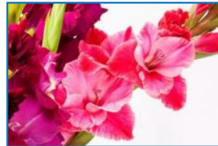
August Birth Flower: Gladiolus