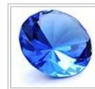
September Birthstone: Sapphire