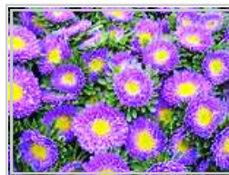
September Birth Flower: Aster