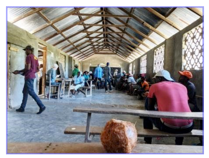
Triage area of the Bel Aire clinic in Haiti

Washing the scent of Haiti from my clothes and gathering adjectives and movements, memories and layered dreams. Lush and harsh, the landscape frames our days, beginning and ending with steps duly counted and innumerable. Holding hundreds of hands-Strangers sharing shy smiles and secret prayers in the shady spot under a tree, in a breezeway between classrooms recognizable by virtue of the blackboard painted on the far wall, in the shadow of the church. facing rows of expectant faces lined up, waiting. I want to ask so many questions, but with maybe four words of language shared, all I can do is sit and smile and pat the hand resting on my knee, open and relaxed, trusting my expertise acquired five minutes ago and over centuries of asserting white supremacy. Acrid smoke of charcoal fires still clings to my clothes as I load the washing machine directly from my suitcase. Unpacking may take a lifetime.