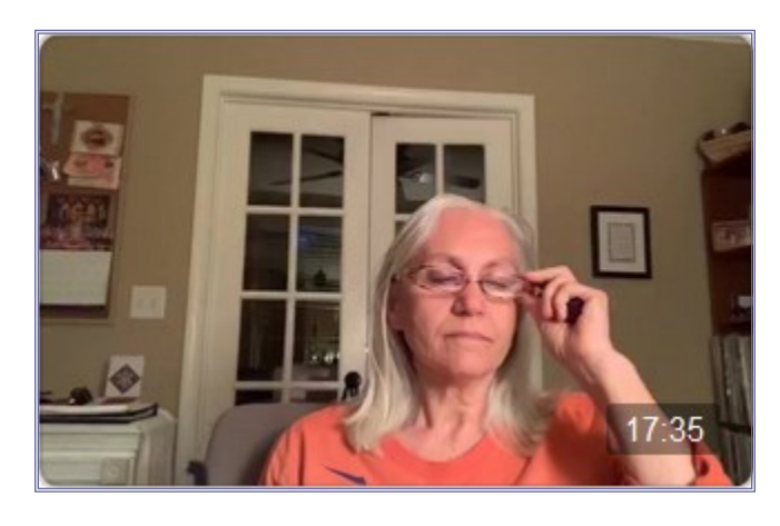
Compline: Bedtime Prayers for Us All at 8:30 pm