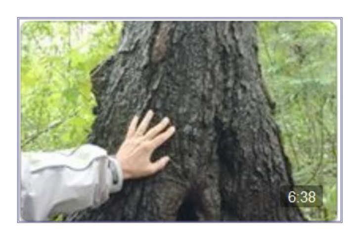
Earth Day Meditations 2020