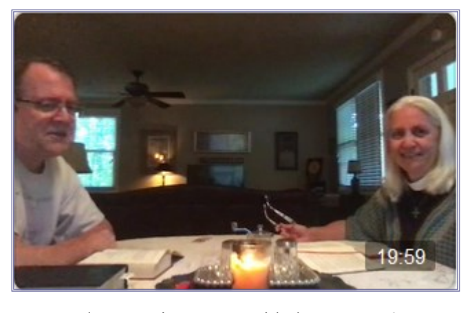
Monday Morning Prayer with the Cates at 9 am