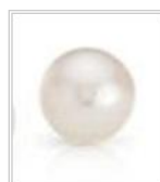
June Birthstone: Pearl