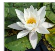
July Birth Flower: Water Lily