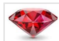
July Birthstone Ruby