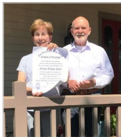
RETIRES AS EfM MENTOR