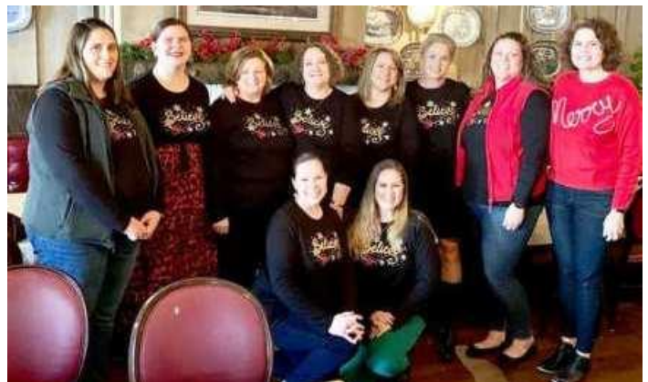
2019-2020 EDS Staff