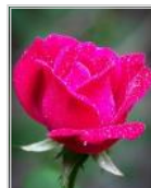
June Birth Flower: Rose