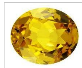
November Birthstone Topaz

Due to power outage and other unforeseen circumstances, the Monthly Financial Update will be provided in HT Notes next week.