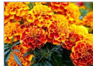
November Birth Flower Chrysanthemum