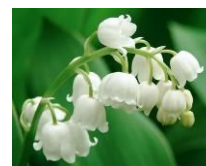
May Birth Flower: Lily of the Valley