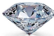
April Birthstone: Diamond