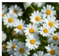
April Birth Flower: Daisy