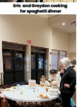
Thank you for supporting us!