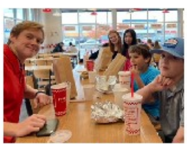
Fuel before fun

I am working to continue to grow our community connection efforts. We have several opportunities coming up each month starting in January. Be on the lookout for ways you can contribute.