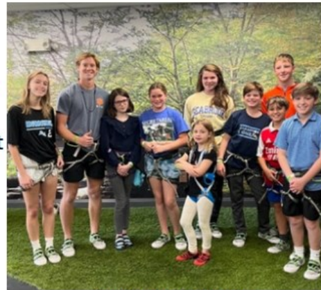
Our "Project Rock" crew