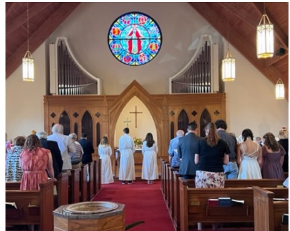
Our acolytes are a blessing.

HTTPS://WWW.HOLYTRINITYCLEMSAN.ORG/MINISTRIES/FAMILYMINISTRY/