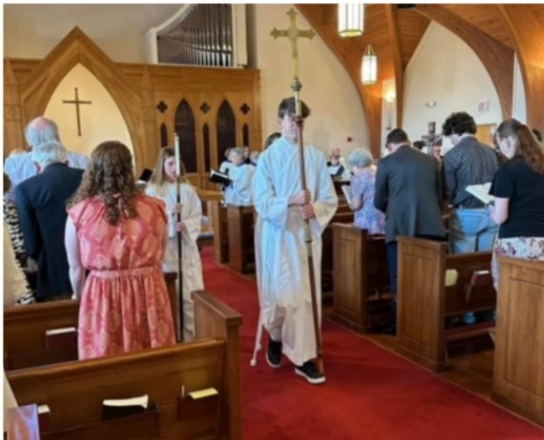
Thank you to all of those who have served as an acolyte.