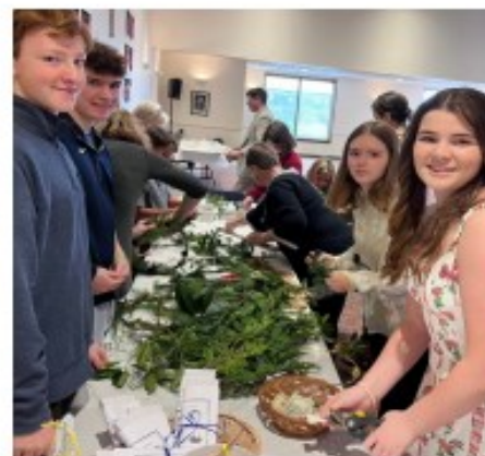
Some of our awesome youth