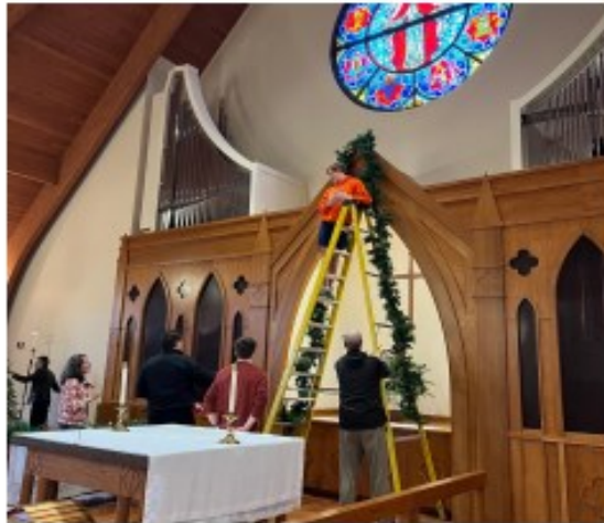
Eric braved the ladder with lots of adult supervision