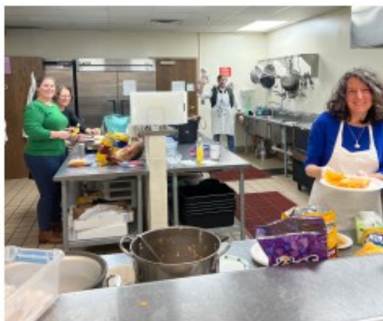
The "Souper" Crew!