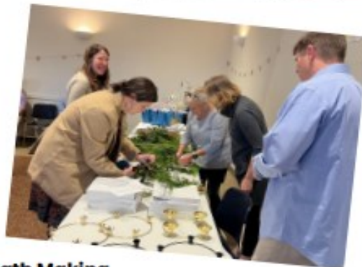
Advent Wreath Making