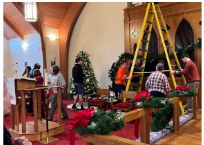
Everyone working together to make our church beautiful for Christmas