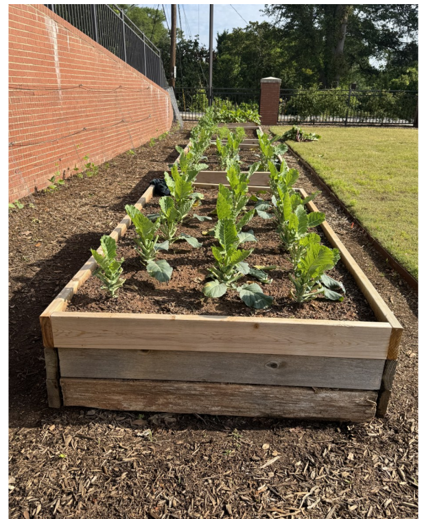
It won't be long before we have even more vegetables to harvest, making room for more vegetables to plant.