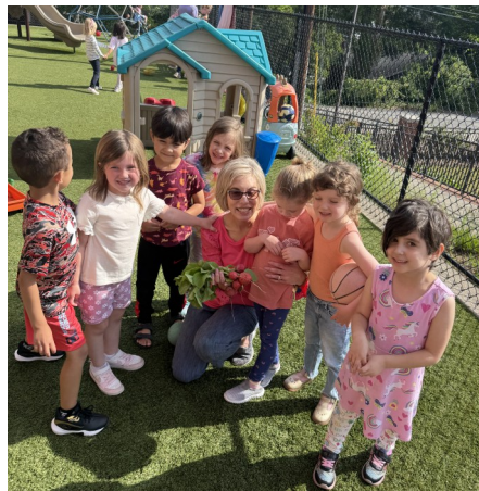
EDS students show off a harvest of radishes from the three EDS beds, one bed for each class.