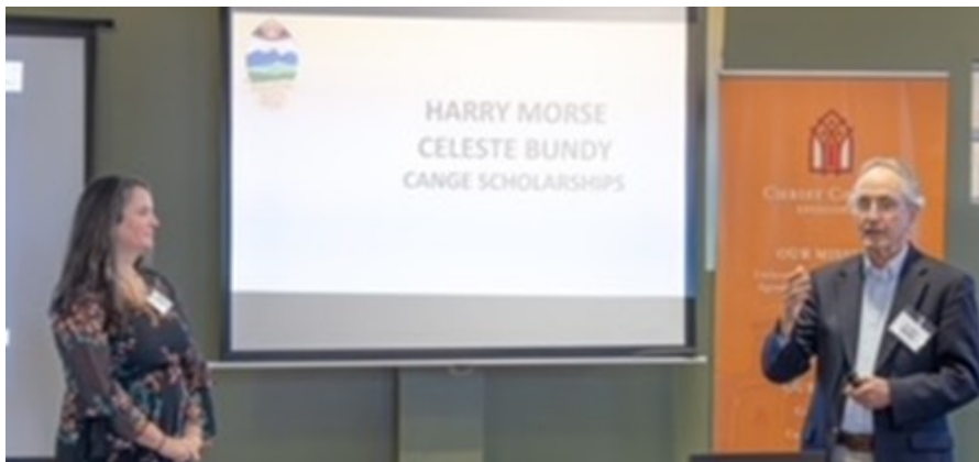
Education Equals Hope